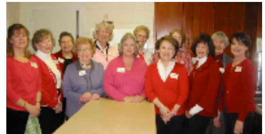
February Luncheon committee