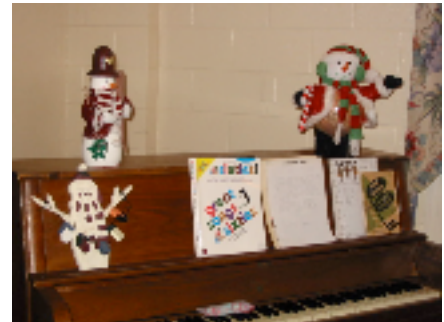
Who said Winter could not be fun